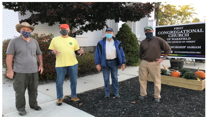
The men from the Men's Fellowship Group