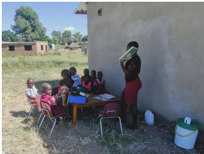
A small group of kids are learning outside while they wait for the floor to be "cured."