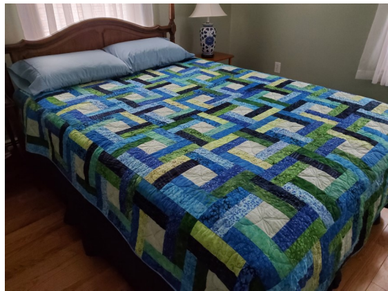
“Windows of Hope”

This year’s quilt was actually made in 2020 and then the pandemic hit. We are finally able to raffle it off this year. It is a queen size quilt pieced by the Parish-Helpers Quilters. Tickets for the raffle are $5 each or 3 for $10. You can purchase your ticket from any of the Parish Helpers and at the Village Fair or Treasure Shop. The winning ticket will be drawn in November!