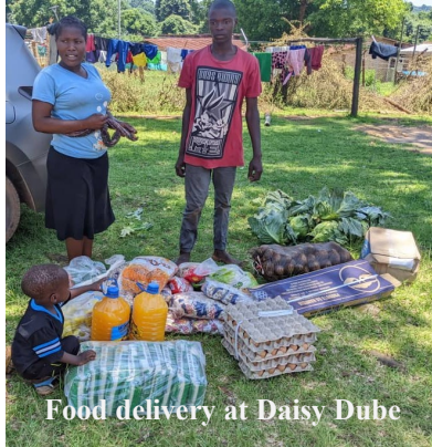
Food delivery at Daisy Dube

December is sponsorship renewal month for many of our friends and supporters, as well as an opportunity to support other Zimbabwe projects through Alternative Giving. It is with this giving that the budget for Daisy Dube food support is set for 2023. The PKZ team is so deeply appreciative of the generosity which abounds within FCCW and beyond!